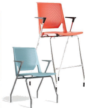
Haworth Very Seating