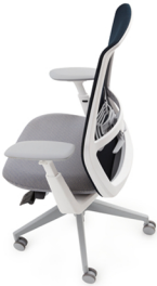
Soji Task Seating