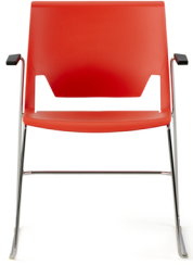
Very Wire Stacker