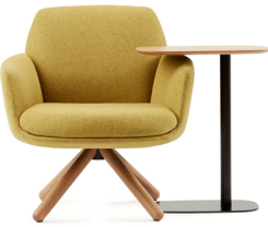
Poppy Seating & Pip Table