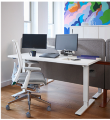
Hop Height Adjustable Table