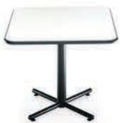
450 Series Table

UniGroup Panel System Very Task Seating Very Side Seating System 12 Side Seating X-Series Metal Storage 450 Series Table Planes Conference Table Enclose Walls