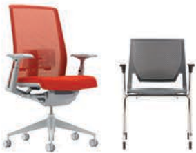
Very Task Chair and Very Side Seating