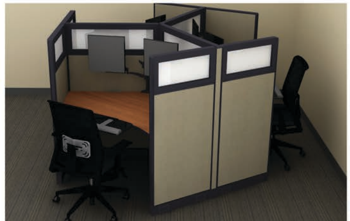
Design Rendering: Workstation Pod