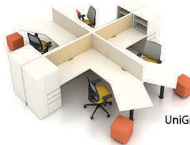
UniGroup Panel System