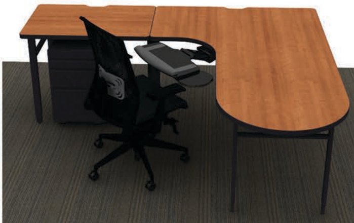
Design Rendering: Ergonomic Typical