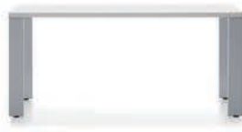
Planes Conference Table